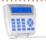
CLASSIKA LCD Two-line LCD control keypad, with 3 status LEDs.