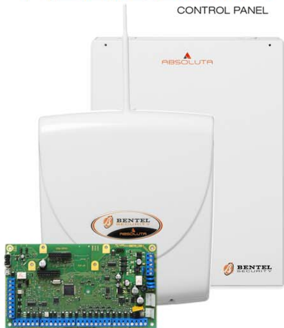
ABSOLUTA HYBRID CONTROL PANEL UP TO 104 ZONES ABS16, ABS42, ABS104