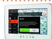
M-TOUCH 7" colour TouchScreen keypad with an extremely intuitive menu for users and installers.