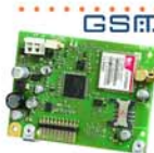
ABS-GSM GSM/GPRS/SMS Communication board for Absoluta control panels.