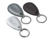
PROXI TAG 60 x 30 mm proximity tag, available in white, grey and black.