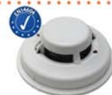
KSD20 EN14604 Wireless optical smoke detector.