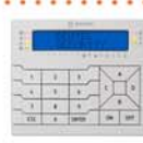
PREMIUM LCD Two-line LCD control keypad with proximity reader and 3 programmable I/O terminals.