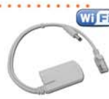
ABS-VAP11N WiFi Bridge for ABS-IP board.