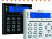
ABSOLUTA T-BLACK & T-WHITE Integrated proximity reader for keys, cards and tags; 3 on-board I/O terminals; Supports Roller Blind