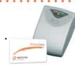
PROXI & PROXI-CARD Proximity key/card reader for indoor/outdoor use (IP34). *Proximity card.