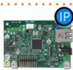
ABS-IP Ethernet TCP/IP Communication board.