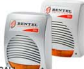
CALL Self-powered siren for outdoor use with flasher. Available in antifoam and strobe versions.